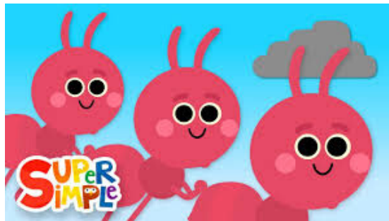
The Ants Go Marching