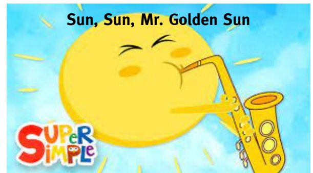
Super Simple Songs