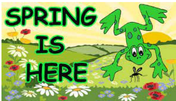
The Learning Station