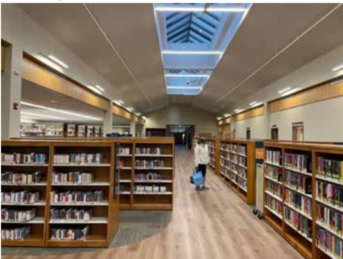
The main reading room provides a bright, open space for browsing refreshed rows of materials.