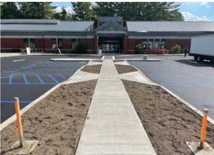
This new pedestrian walkway paves the way toward safer entry into the library.

Potential dangers will be mitigated by a new peninsula which runs north-south through the center of the parking lot, allowing visitors to stroll on a landscaped sidewalk most of the way to the entrance. Along that sidewalk we'll have additional handicapped spaces and two level-2 electric charging stations , capable of charging four vehicles at a time. The charging stations were completely covered by grants from NYSERDA, including funds to pay for installation.