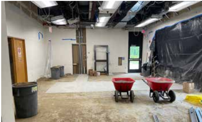
The Normanskill Room, our former curbside location, is being transformed into an inviting cafe' for all to enjoy.

The Normanskill Room will become a café , rented from the library by a vendor yet-to-be-determined. We will soon issue the RFP (Request for Proposals) for prospective vendors, and hope to have a tenant in this space by October or November. This is the one major aspect of the renovation which will not be fully functional upon reopening. However, when it's operational, we think it will be a great amenity for library users—a place for coffee and other beverages, sandwiches, snacks, and perhaps some soups and salads, prepared offsite but available daily. The building design will allow the café to be open even when the library is not, depending on the vendor's preference.