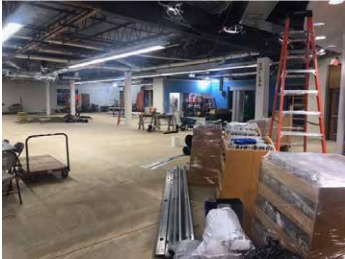
The former children's and fiction areas

knew are gone, and the floor has been dug up where necessary to allow for more public restrooms. Saws that cut into existing concrete flooring are quite loud! Electrical, mechanical, data cabling and sprinkler system work is going on throughout the building, and some emergency escape windows are being turned into doors.