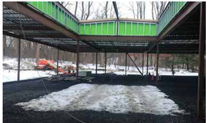
Current view of our children's addition

In the existing building, all space once devoted to children's services, shelving for the book collection, and staff offices is currently empty and being renovated. All the walls you once