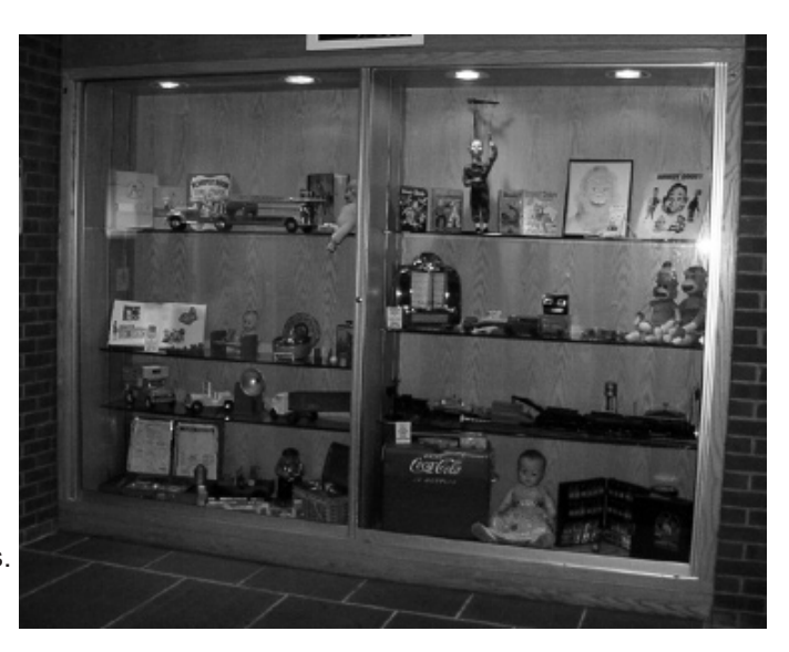
Exhibit Room: Helderberg Room

3. Glass shelving is vertically adjustable in standard 1" increments. Shelf mounting is via spring clips.