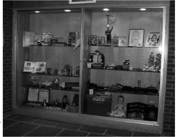
Exhibit Rooms: Helderberg Room